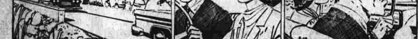
THE STORY OF MARTHA WAYNE