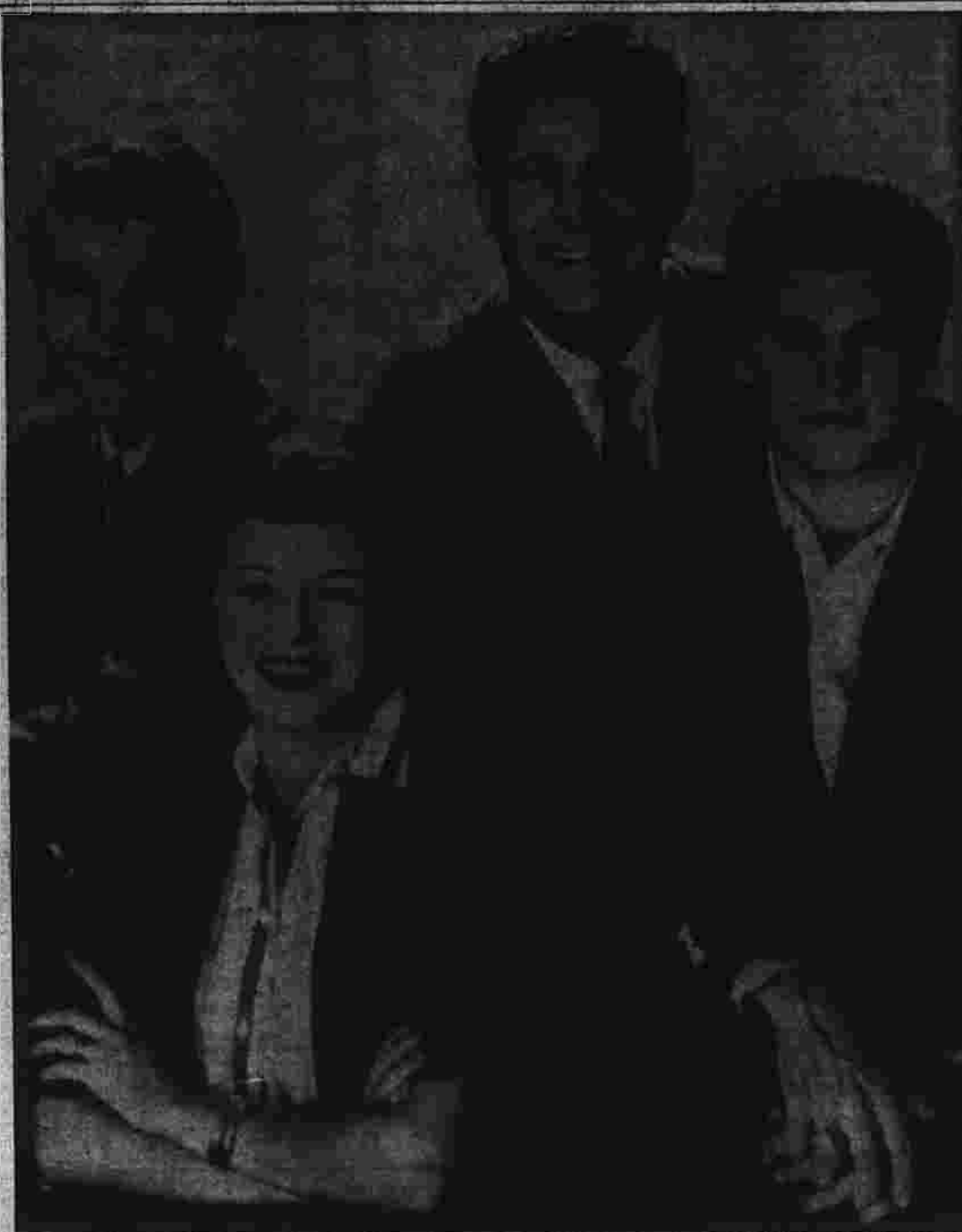
David, Harriet, Ozzie and Ricky

treated us as children many years," alleges Dave. "Maybe that's because Rick and I have been earning our own way for more than 14 years."